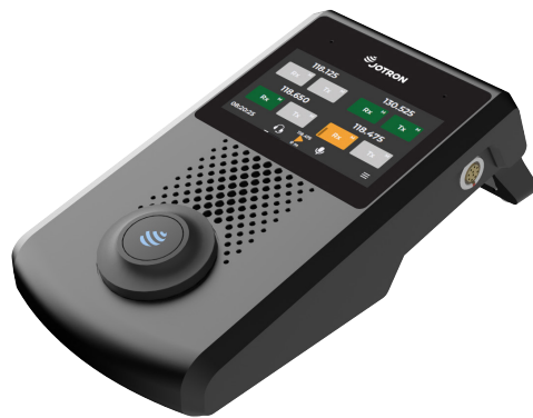
RC-8D Desktop version