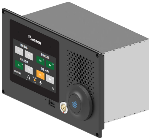
RC-8C for console mounting