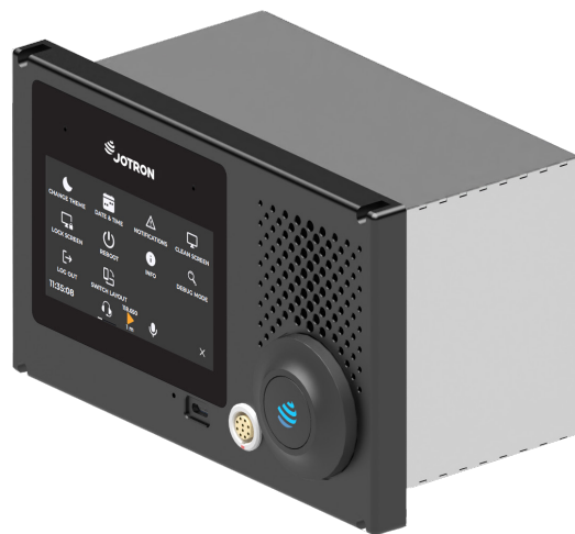
RC-8SR for subrack mounting